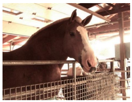
Big Ben, 3006 lb. Belgium Draft Horse

• Homemade candy shop - enjoy sampling of cashew crunch, turtle bars, truffles, butter caramel puffs, and more